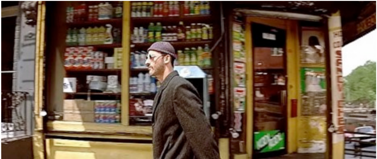
Grocery Shop, East 97th Street and Park Avenue, Manhattan.